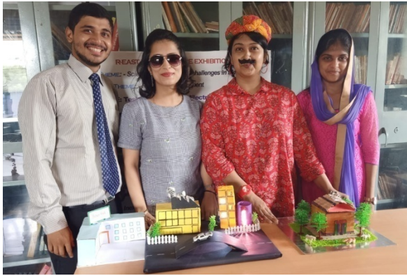
Theme teaching group